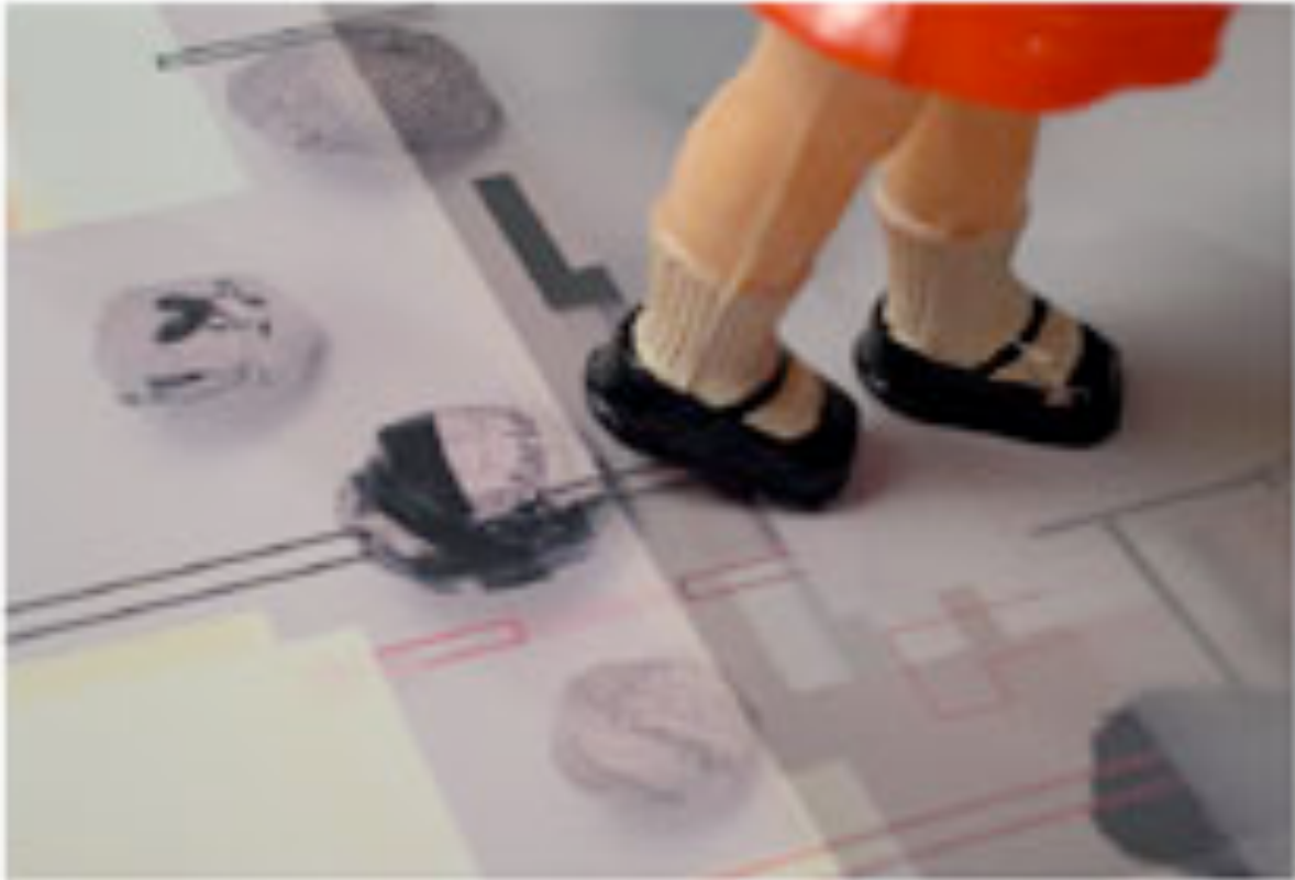
Footprints / 2008 / mixed media / 10" x 15" / Hosfelt Gallery