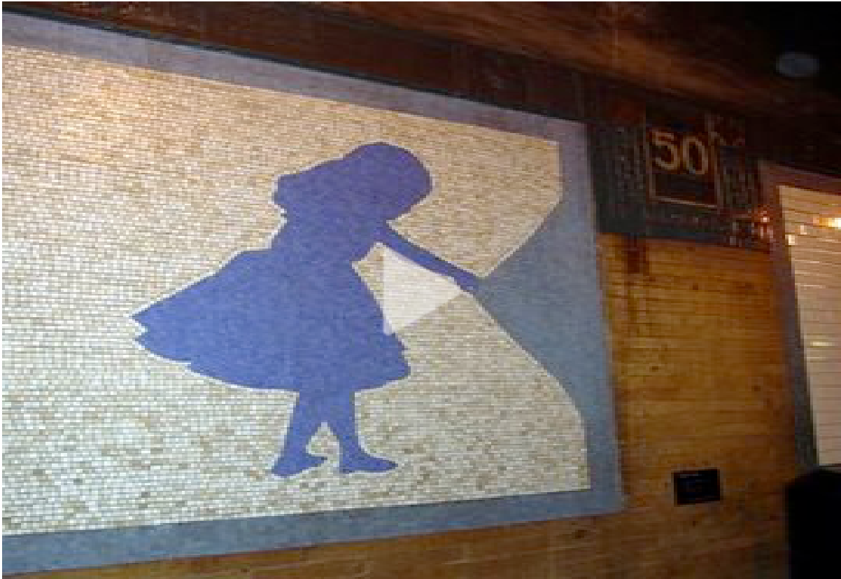
Footprints / 2008 / video / 12 minutes / Hosfelt Gallery